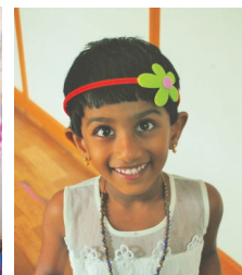
It's cool back to Deepthi school