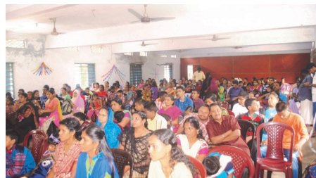
Children and parents