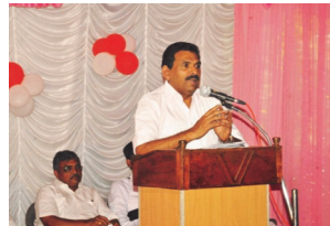
Mr. Anto Antony, M.P