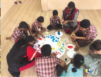
Arts Day at Deepthi